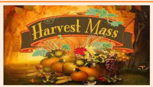
Harvest Mass & Donations

Staff are noticing that parents are giving their children food when they pick up children and it is being consumed on school grounds. This goes against the healthy eating allergy guidelines that other children may have allergies to the foods (especially if it is brought in from a bakery etc).